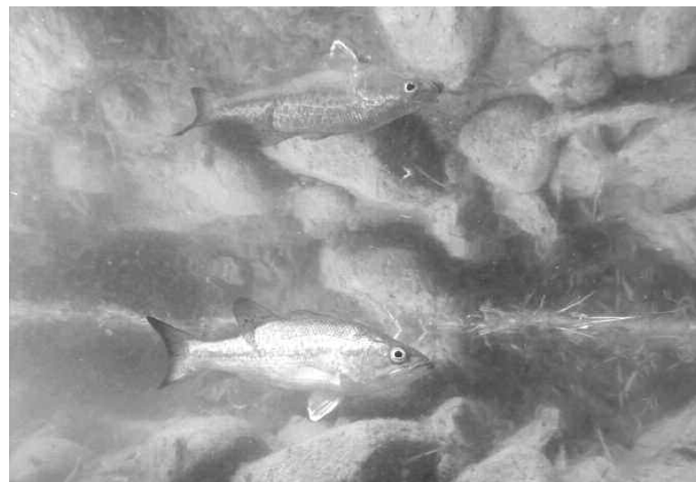
Creative Capture: This largemouth bass photo was captured under water and the reflection off the water surface created a mirror image of the fish.