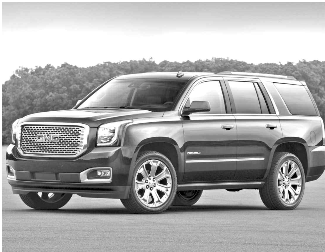
GMC has announced the 2016 Yukon SLT Premium Edition - a chrome-trimmed special model offering a premium, personalized appearance on SLT models.